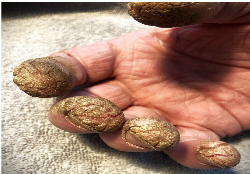
A week after one treatment, the infected layer was falling off and clear skin emerging.