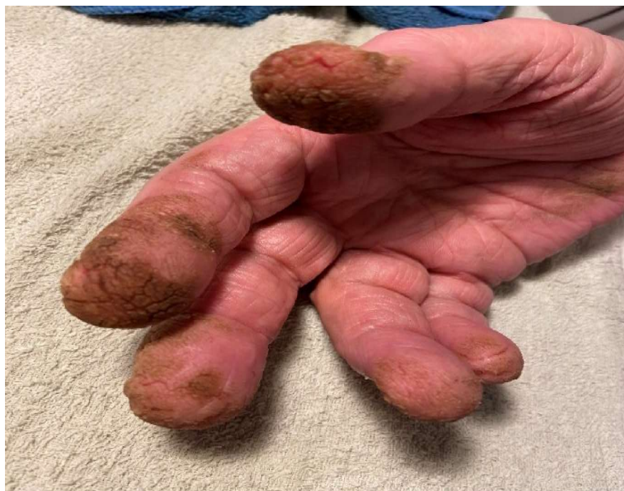
Five months later his hands were clearing. By the end of August 2024 the clearing continues.